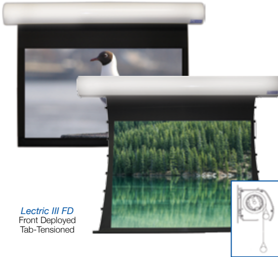
Lectric III FD Front Deployed Tab-Tensioned